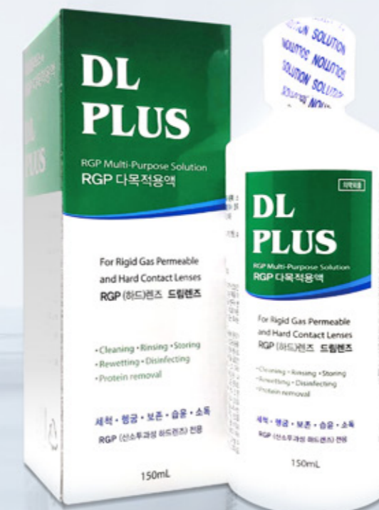
DL Plus solution 150ml