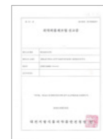
Certificate of Pharmaceutical (Quasi drugs) Manufacturing License

In addition, we are supplying products under contract with leading lens specialty stores in Korea, such as O-Lens, Lens Town, and Lens Diva.