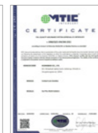
CE Certificate (MTIC)