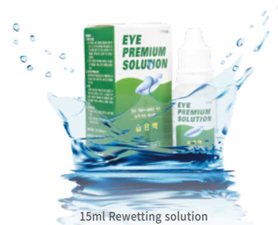
15ml Rewetting solution