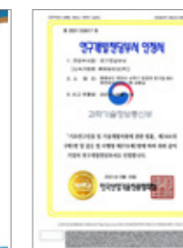
Certificate of R&D Department