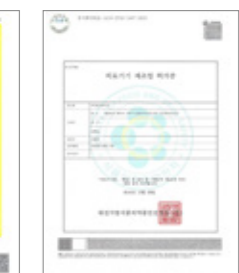
Medical Device Manufacturing License