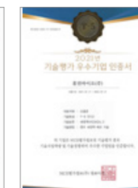
Certificate of Excellent Technology Evaluation Company