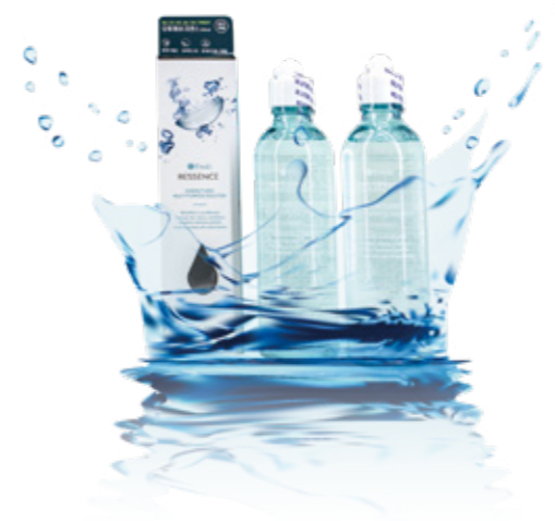
Purecle Solution 150ml