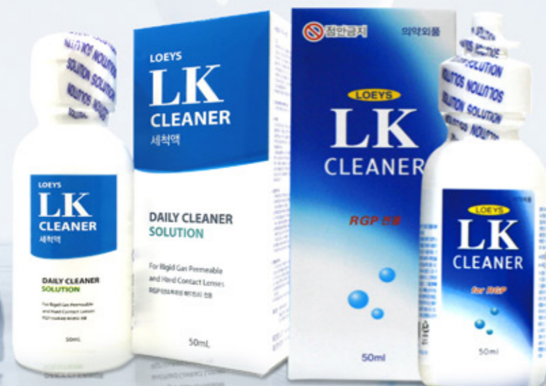
Lloyds LK Solution 50ml, 30ml