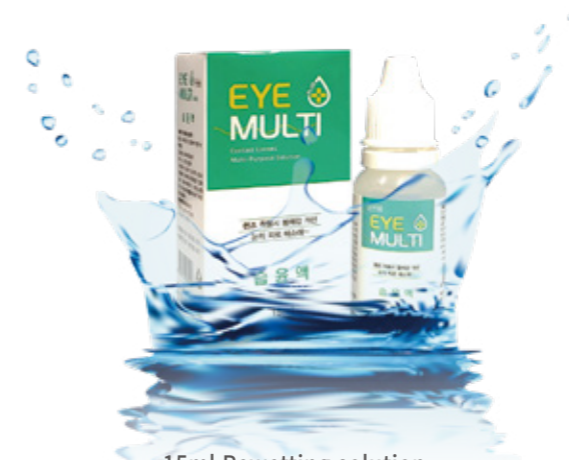
15ml Rewetting solution