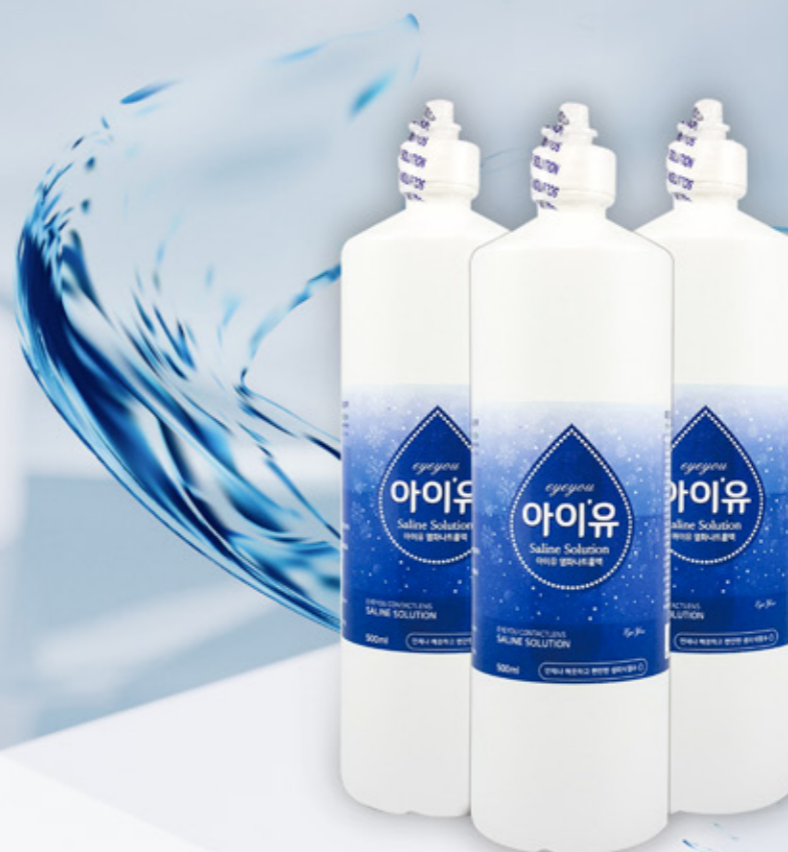
Eyeyou Saline Solution 500ml