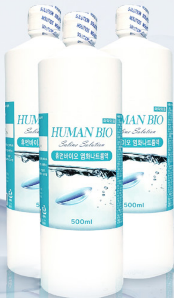
Saline Solution 500ml

Always clean and comfortable Saline solution Hard Lens • Dream Lens • Soft Lens Available for all lenses