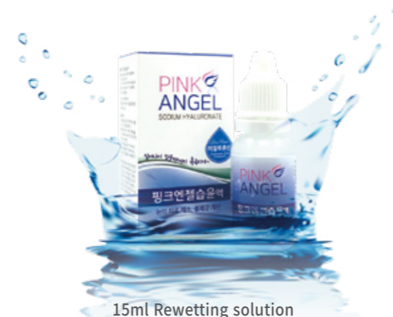
15ml Rewetting solution